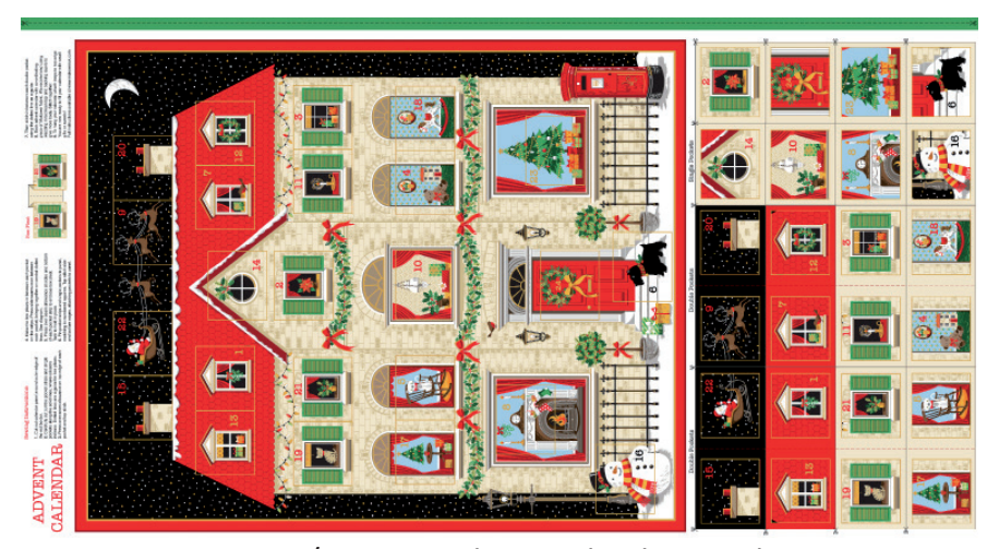
2133/1 House Advent Calendar Panel